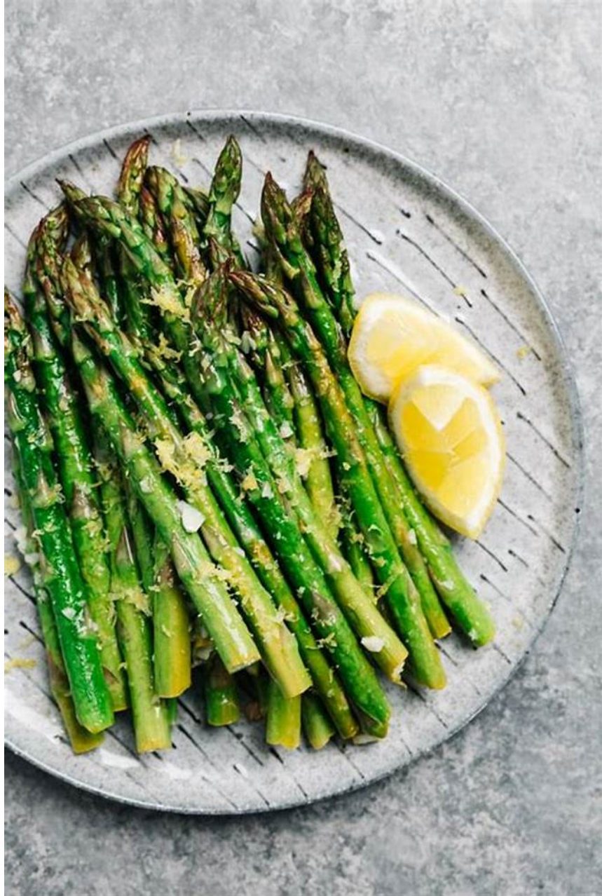
Roasted Lemon Garlic Asparagus recipe from America's Test Kitchen Light & Healthy 2024